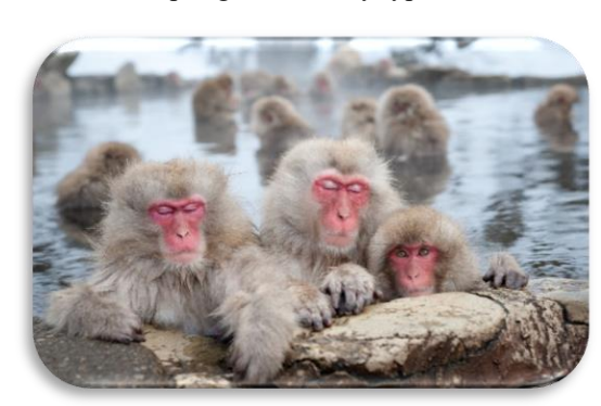
Japanese macaques at Jigokudani Monkey Park