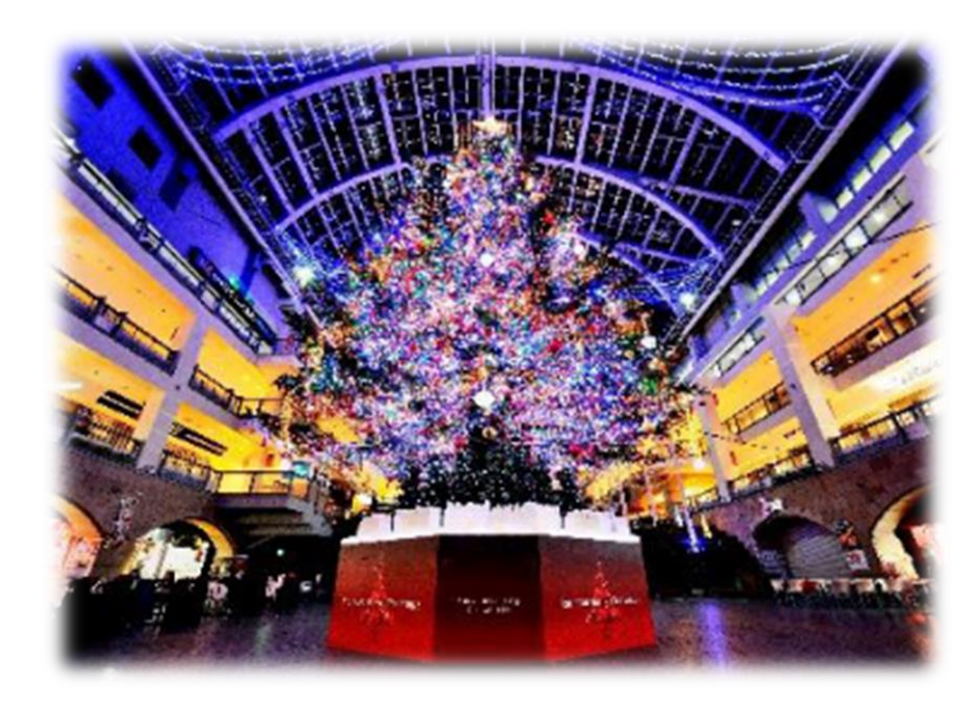
Sapporo Factory Christmas tree lighting ceremony, 2018

On November 3, a lighting ceremony for the Christmas tree was held at Sapporo Factory.